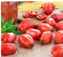
San Marzano Salad Tomato

Heirloom. A vigorous indeterminate cherry that produces heavy clusters of 8-12 dark purple and golden yellow fruits that are very high in the phyto-nutrient, Anthocyanin. Foliage is tinged purple as well. A unique addition to summer salads! $3.50 each