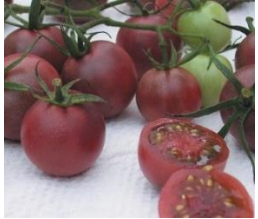
Chocolate Cherry Tomato

Heirloom. Yellow beefsteak covered with a red blush, juicy and strong with a balanced taste. $3.50 each