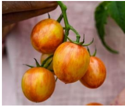
NEW Sunrise Bumblebee Cherry Tomato

Heirloom. Deep colour and complex flavour. A really unique Heirloom tomato with incredible flavour and colour. Chocolate cherry produces very deep purple, 1/2oz cherry tomatoes on a large indeterminate plant. Very sweet with exceptional tomato flavour, this variety really stood out in the trials. 65 days after transplanting. $3.50 each