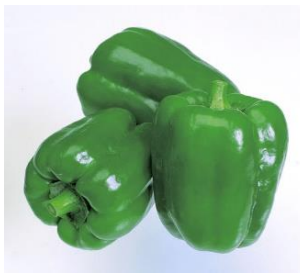
New Ace Sweet Pepper - Bell type

AAS winner. Excellent flavour and first to turn red. We are continuously amazed at Carmen's earliness, sweet flavour and dependability. An All America Standards winner that is perfect for use in salads or roasting, Very sweet and quite heavy yielding. This hybrid was developed to set fruit under cooler conditions so it is a great choice for short season areas. 2.5" fruit. 65 days to green and 80 days to red from transplanting. $3.50 each