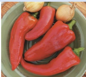
Carmen Sweet Pepper - Bell type

AAS winner. Excellent flavour and first to turn red. We are continuously amazed at Carmen's earliness, sweet flavour and dependability. An All America Standards winner that is perfect for use in salads or roasting, Very sweet and quite heavy yielding. This hybrid was developed to set fruit under cooler conditions so it is a great choice for short season areas. 2.5" fruit. 65 days to green and 80 days to red from transplanting. $3.50 each