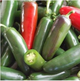
Early Jalapeno - Organic Hot Pepper

Early Jalapeno produces dark green 1.5" jalapeno peppers with a nice amount of heat. 8,000 scoville units. Maturity 65 days to green, 85 days to red. $3.50 each