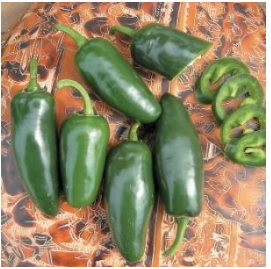
NEW Monet Hot Pepper – Jalapeno type

Early Jalapeno produces dark green 1.5" jalapeno peppers with a nice amount of heat. 8,000 scoville units. Maturity 65 days to green, 85 days to red. $3.50 each