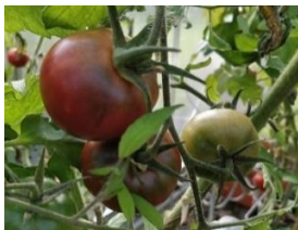
NEW Black Crick Salad Tomato

Heirloom. Determinate. The Italian heirloom that is famous for sun drying. Small 1-to 2-oz, grape-shaped fruit is very dry and has few seeds. It has a rich tomato taste that is wonderful for sauces. Vines yield clusters of fruit in abundance, perfect for selling in fresh markets and making specialty products. $3.50 each