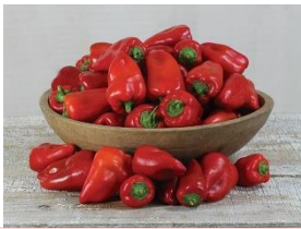
Lipstick Sweet Pepper - Pimiento type

Heirloom. A delicious pepper with 4-inch long tapered, pimiento type fruit that is super sweet. This fine pepper is early and ripens well in the North. A flavorful favorite with thick, red flesh. $3.50 each