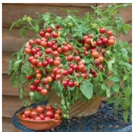
NEW Cherry Falls Organic

Hybrid. Pear shaped paste tomato with high yields over a long season. Fruits in clusters are crack resist. Meaty flesh, mild flavor with little juice is excellent for sauce. One of the best paste tomatoes with a better flavor than 'Roma'. Indeterminate. 70-90 days. $3.50 each