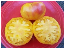
NEW Dwarf Caiydid Beefsteak Type Tomato

Heirloom. Yellow beefsteak covered with a red blush, juicy and strong with a balanced taste. $3.50 each