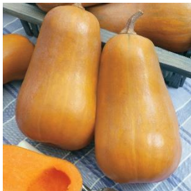
NEW Honeybaby Butternut Squash

All-America Selections Winner. Hybrid. Weighing in at just about a half a pound per fruit, Honeybaby butternut squashes have all the nutty, sweet flavor of their larger counterparts, but on much smaller, 2-3 foot, semi-bush type vines. Each plant produces about 9 lightbulb-shaped, golden tan squashes that store well for future winter meals. Honeybaby is resistant to powdery mildew, making it a good choice for climates with humid summers.