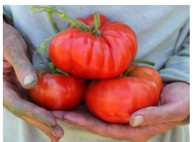
NEW Pantano Romanesco Beefsteak Type Tomato

Heirloom. This is a special variety that was brought back from the mountains in Lebanon. The tomatoes can get huge— as much as 3 lbs! The flavour of these meaty tomatoes is fantastic! Indeterminate. Mid-season maturity. $3.50 each