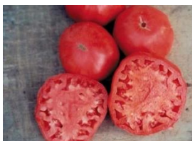
Brandywine Beefsteak Type Tomato

Heirloom. This one is crazy productive and excellent flavour! The medium-size fruits have a flattened shape, and are slightly ribbed and bright red. The flavour of this Roman heirloom is rich and sweet, and it is quite juicy. Indeterminate. Mid-season maturity. $3.50 each