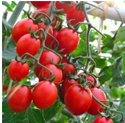
NEW Principe Borghese Salad Tomato

Heirloom. Compact, semi-determinate vines are fairly disease resistant. Deep-red, dual-purpose canning and slicing sort. Smooth, slightly oblate fruit is very dense-fleshed and meaty, and show very little core. Skins are very thick and tough, simplifying peeling when processing, and making the crack-resistant fresh fruits keep extremely well. Fruit runs 3-6 ounces; flavor is very good, and sweet enough for fresh use as well.. $3.50 each