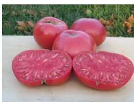
Lebanese Mountain Beefsteak Type Tomato

Heirloom. This is a special variety that was brought back from the mountains in Lebanon. The tomatoes can get huge— as much as 3 lbs! The flavour of these meaty tomatoes is fantastic! Indeterminate. Mid-season maturity. $3.50 each