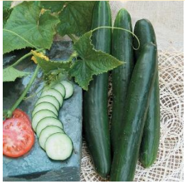
NEW Summer Dance Cucumber

Very long and thin skinned. These early, incredibly crisp, smooth cucumbers. Summer Dance is one of the best tasting, fresh eating cucumbers. Produces heavy yields of uniform dark green fruit that grows up to 10 inches long. Very straight for such a long cucumber. Tolerant to heat stress. Matures in 45 days.