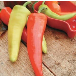
Hot Hungarian - Wax Pepper

AAS winner. A versatile and flavorful cayenne. Tremendous flavor on first bite, with warm heat that lingers. Thick enough for a bit of crunch when eaten fresh, but thin enough to dry easily. Just enough heat to satisfy "pepper heads"—who can eat the peppers whole—but mild enough to slice thinly onto a salad. Makes excellent powder, flakes, and hot sauce. Also nice fried or in stir fries. Matures early. High-yielding plants. Fruits avg. 4–4 1/2" long. $3.50 each