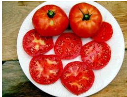
NEW Peron Salad Tomato

Heirloom. Pinkish-red with yellow striping in colour. Excellent sweet tany flavour, with internal pink marbling. $3.50 each