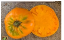
NEW Cero Blackburn Orange Beefsteak Type Tomato

Heirloom. An old Cherokee Indian heirloom, pre-1890 variety; beautiful, deep, dusky purple-pink color, superb sweet flavor, and very-large-sized fruit. Try this one for real old-time tomato flavor. A favourite dark tomato and one of our best selling varieties. $3.50 each