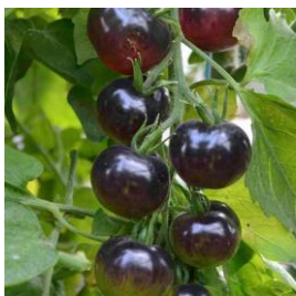
NEW Blueberry Salad Tomato

Heirloom. A vigorous indeterminate cherry that produces heavy clusters of 8-12 dark purple and golden yellow fruits that are very high in the phyto-nutrient, Anthocyanin. Foliage is tinged purple as well. A unique addition to summer salads! $3.50 each