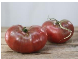
Cherokee Purple Beefsteak Type Tomato

Heirloom. A favorite of many gardeners, large fruit with superb flavour. A great potato-leafed variety from 1885! Beautiful pink fruit up to 1½ lbs each! $3.50 each