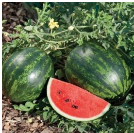
NEW Mini Love Watermelon

AAS Winner. Personal-sized, early, and delicious, Sweet and firm, oval-round fruits avg. 5–7 lb. Distinctive, bright green rind with dark green stripes and dense, bright red flesh. Very productive. AAS winner.